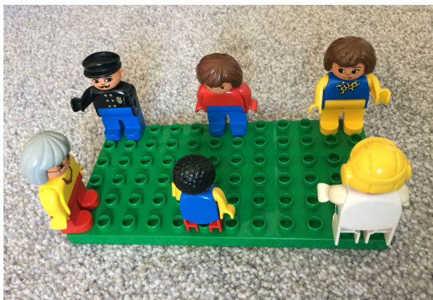
Social distancing continues for us all