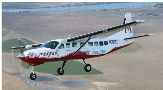
C208B powered by a magniX 500 electric motor

On May 28, yet another electric aircraft took to the skies as Magnix and AeroTEC, both based in Washington State, USA teamed up to launch a Cessna Grand Caravan on its first test flight.